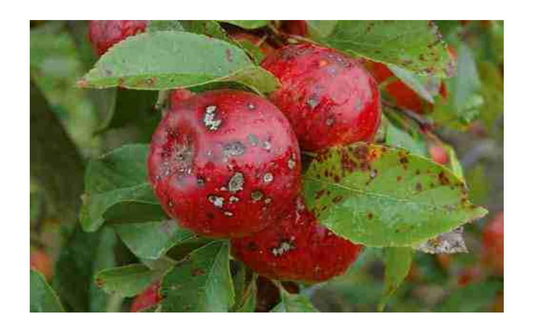
Bred from older varieties BEAUTY OF BATH and WORCESTER PEARMAIN: